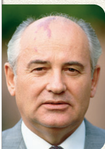
Mikhail Gorbachev 1931–

Mikhail Gorbachev's background shaped the role he would play in history. Both of his grandfathers were arrested during Stalin's purges. Both were eventually freed. However, Gorbachev